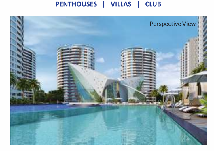
2 BHK, 3 BHK, 4 BHK, PENTHOUSE

RERA REG NO.: PBRERA-SAS80-PR0040 RERA REG NO.: PBRERA-SAS80-PR0323