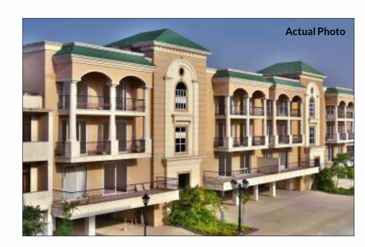
3 BHK & 4 BHK FLOORS