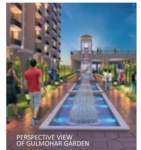
PERSPECTIVE VIEW OF GULMOHAR GARDEN 40% OPEN GREEN AREA