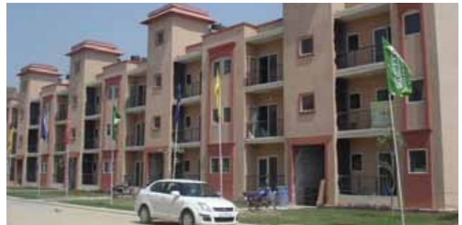
Omaxe Residency, Lucknow