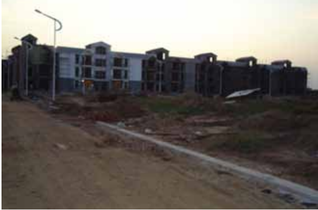
Omaxe Chandigarh Extension, Mullanpur