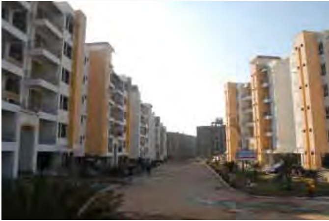
Omaxe Parkwoods, Baddi