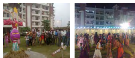
Dussehra celebrations at Omaxe Riviera, Rudrapur

Omaxe organised New Year celebration at Club Heaven in Omaxe City, Mayakhedi, Indore. The function saw packed house.