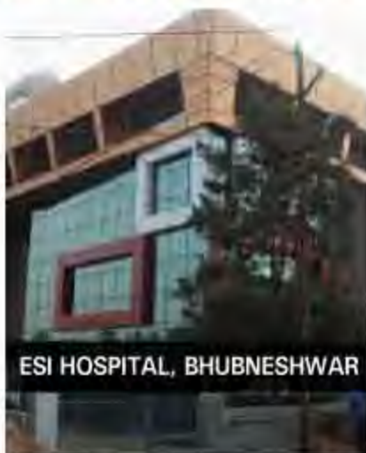
ESI HOSPITAL, BHUBNESHWAR