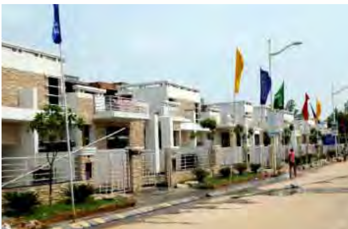
Villas at Omaxe City, Bahadurgarh