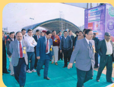
Chandigarh (10-11 December, 2011)