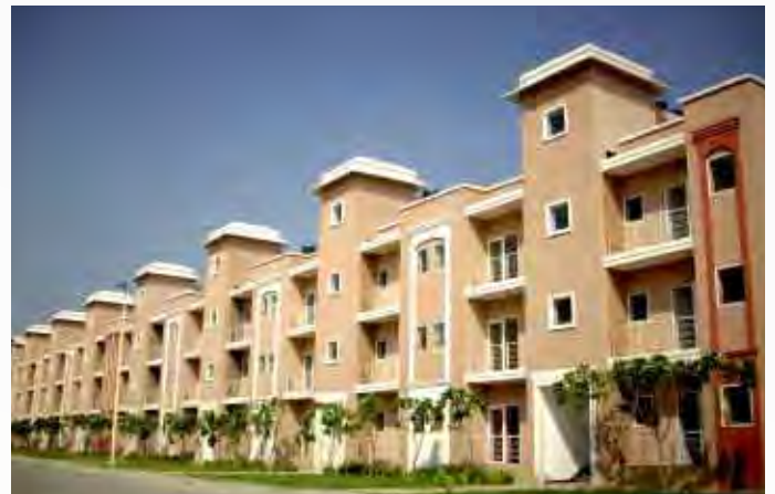
Omaxe Eternity, Vrindavan