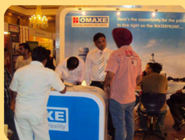
Lucknow (1-2 October, 2011)