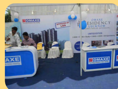
Lucknow (15-16 October, 2011)