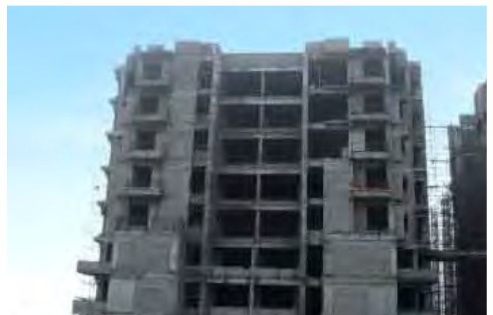
Omaxe Orchid Avenue, Greater Noida