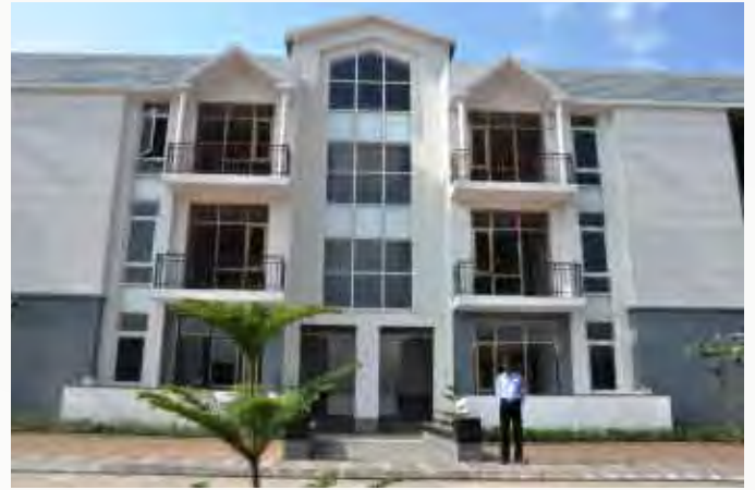
Silver Birch, Omaxe New Chandigarh