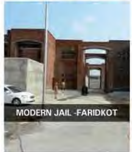
MODERN JAIL -FARIDKOT