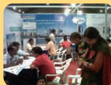
Allahabad (8-9 October, 2011)