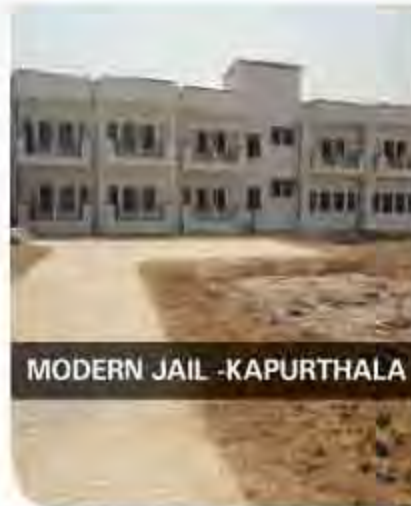
MODERN JAIL -KAPURTHALA