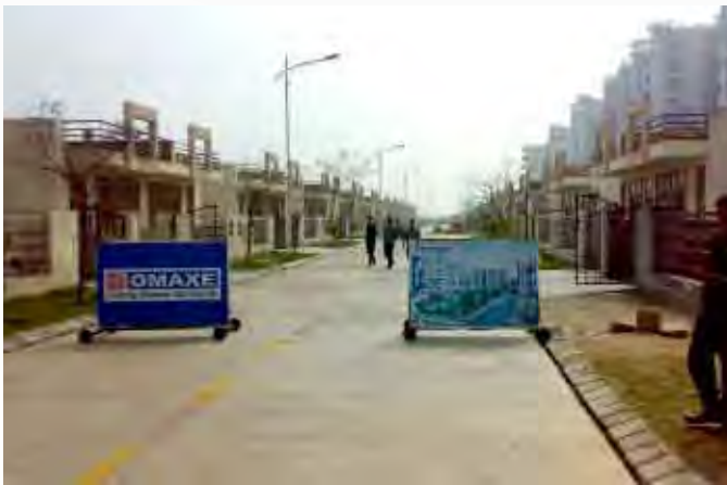
Villas at Omaxe City, Sonapat