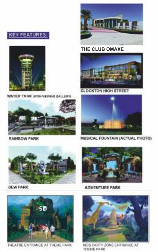
Site Layout Plan of Celestia Royal Omaxe New Chandigarh