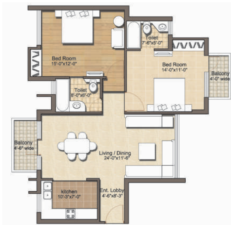
UNIT PLAN TYPE : 1330 sq. ft.

* This is tentative plan subject to approval from the concerned authority