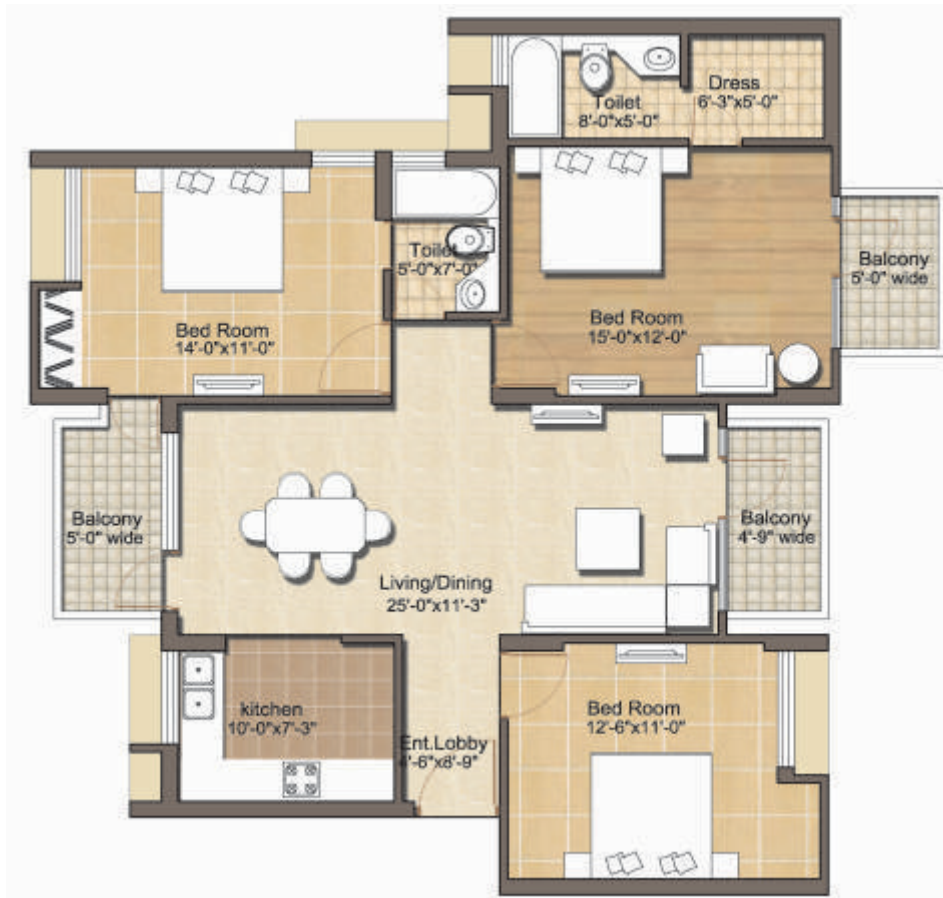
UNIT PLAN TYPE : 1600 sq. ft.

* This is tentative plan subject to approval from the concerned authority