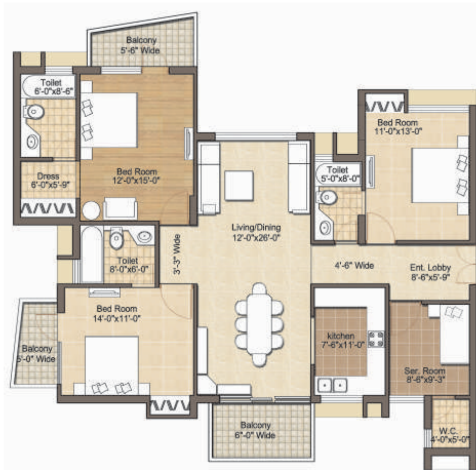
UNIT PLAN TYPE : 1922 sq. ft.

* This is tentative plan subject to approval from the concerned authority