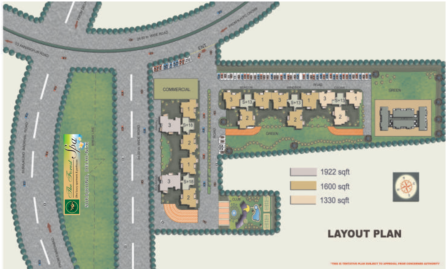
TYPICAL 2 B/R FLOOR PLAN (Saleable Area - 1330 Sq.ft.)