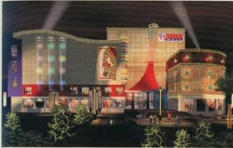
Wedding Mall, Gurgaon