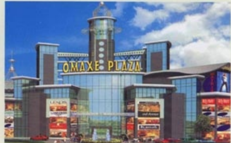
Omaxe Plaza, Gurgaon