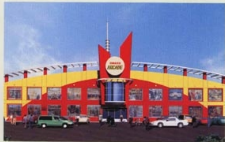
Omaxe Arcade, Greater Noida