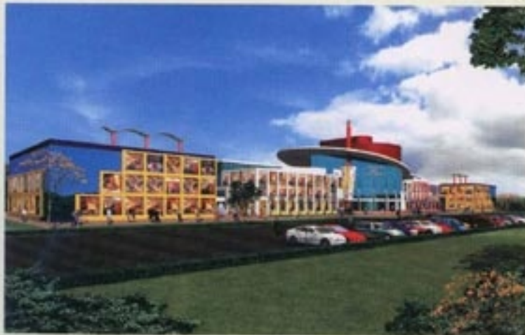
NRI City Centre, Greater Noida