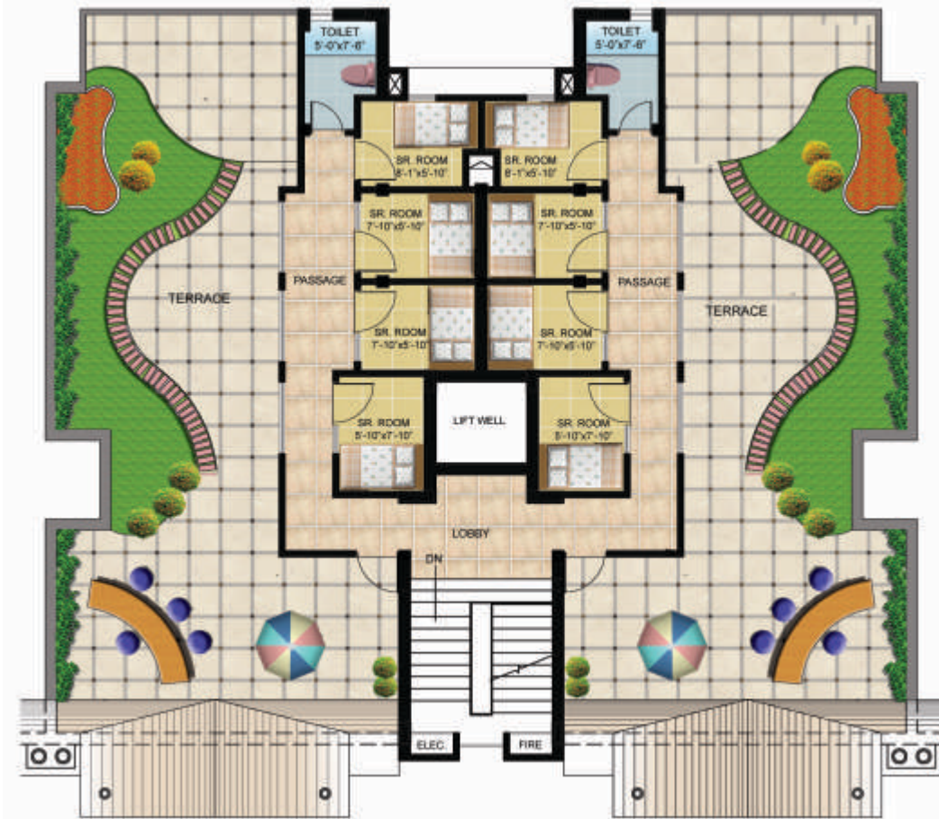
TERRACE FLOOR PLAN (CLUSTER PLAN)