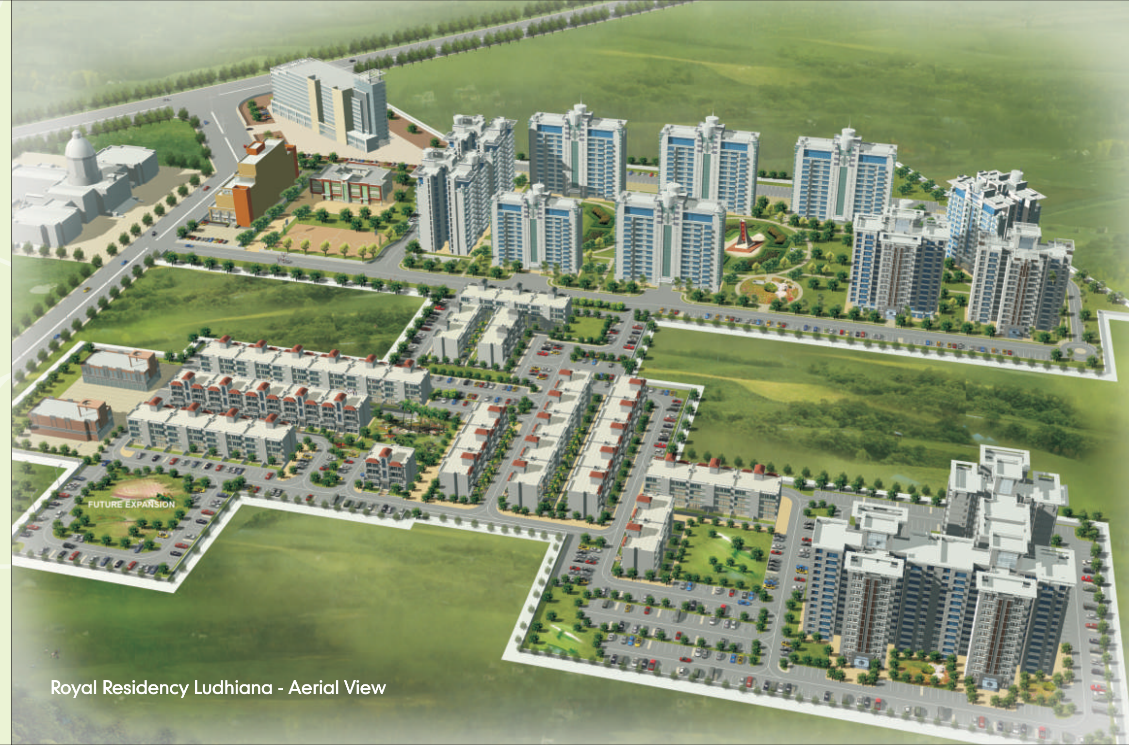
Royal Residency Ludhiana - Aerial View