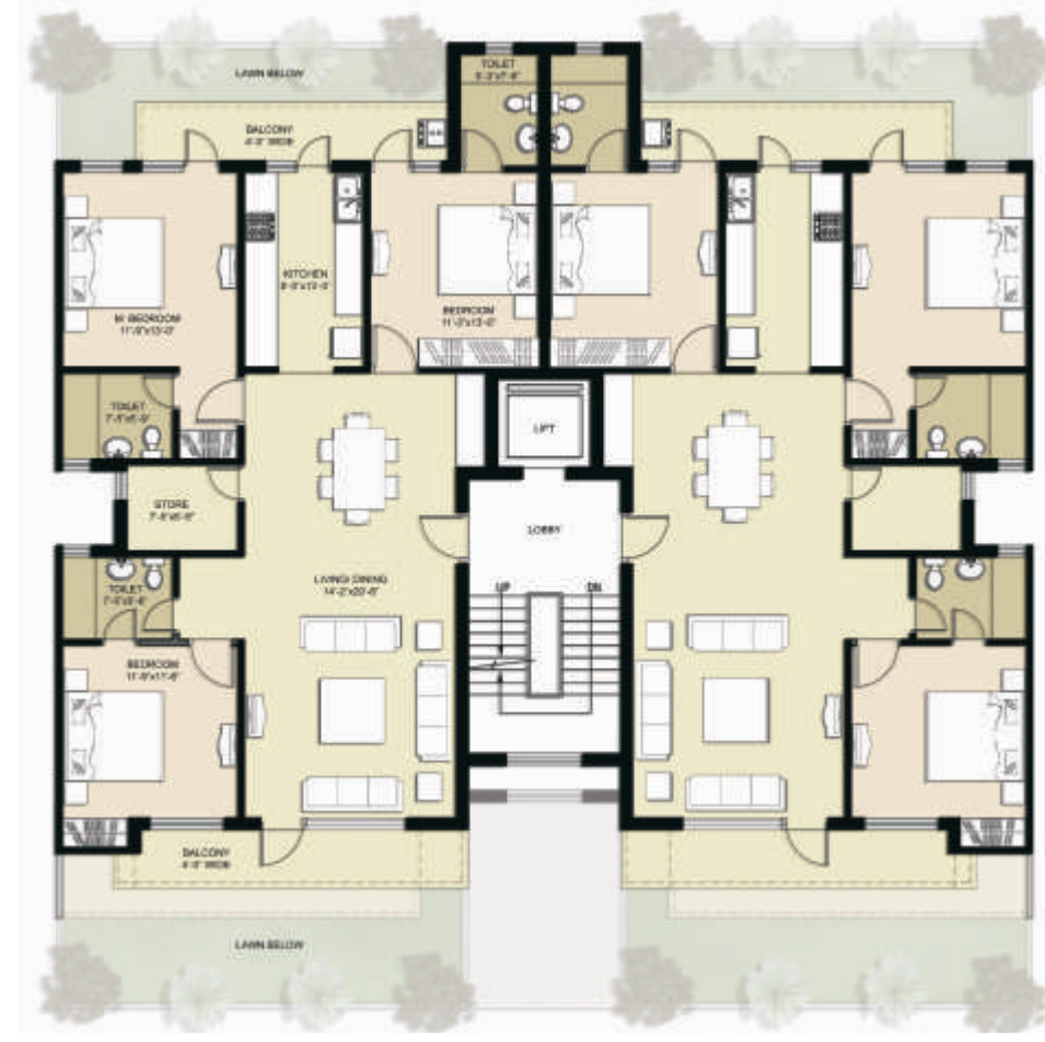
SUPER AREA: 1715 SQ. FT.