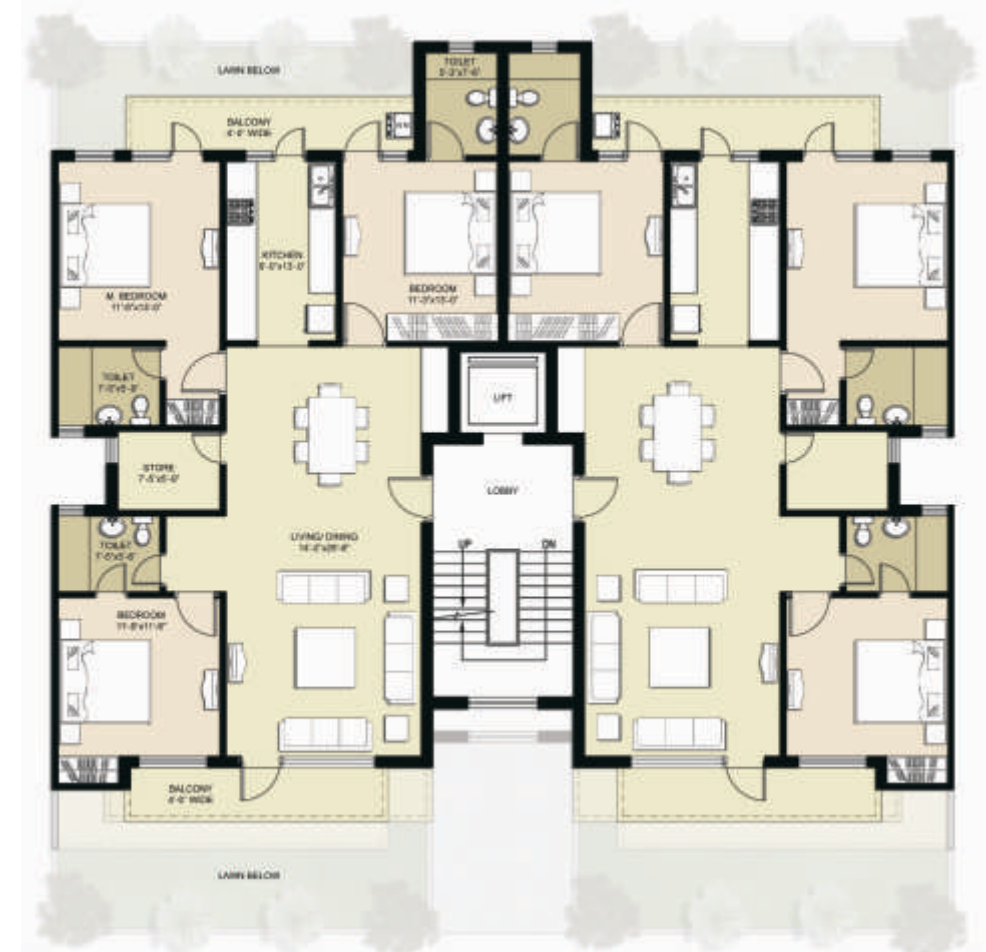
SUPER AREA: 1705 SQ. FT.