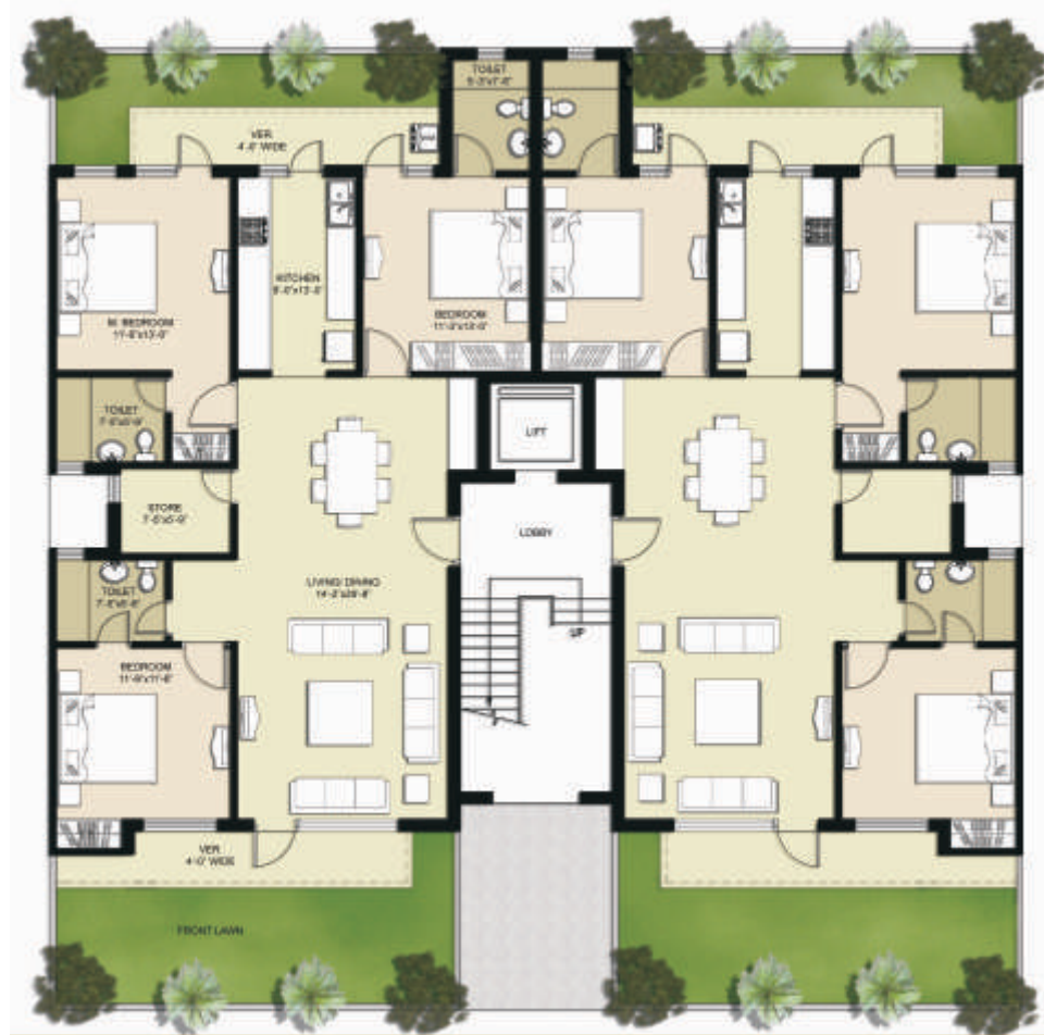
SUPER AREA: 1765 SQ. FT.