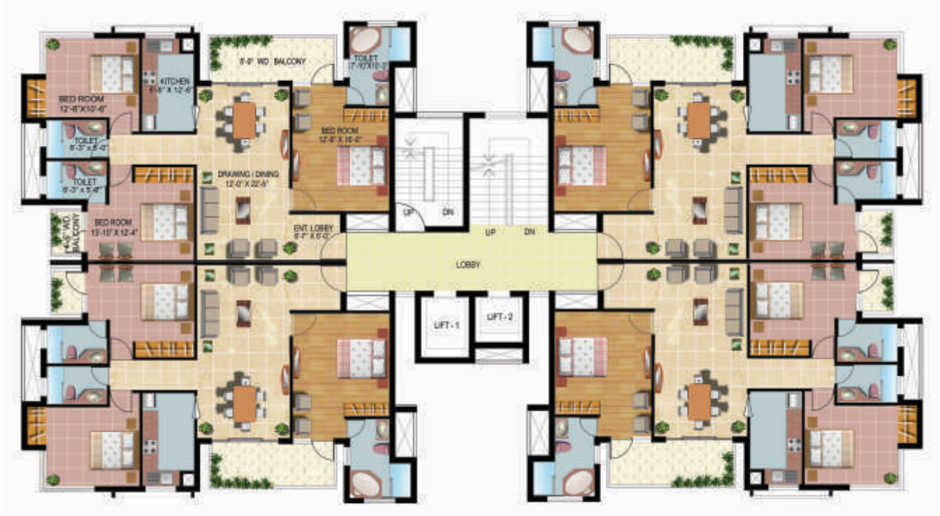
Typical Floor Cluster Plan Super Area = 1600 SQFT/UNIT

* THIS IS TENTATIVE PLAN SUBJECT TO APPROVAL FROM CONCERNED AUTHORITY