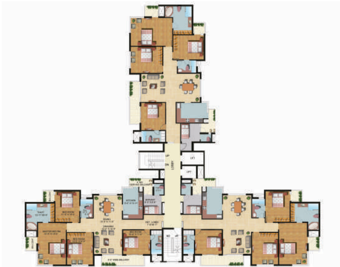
Typical Floor Cluster Plan Super Area = 2350 SQFT/UNIT

* THIS IS TENTATIVE PLAN SUBJECT TO APPROVAL FROM CONCERNED AUTHORITY