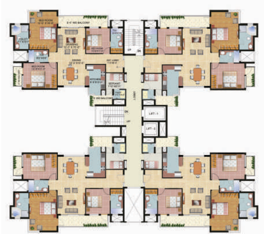
Typical Floor Cluster Plan Super Area = 1900 SQFT/UNIT

* THIS IS TENTATIVE PLAN SUBJECT TO APPROVAL FROM CONCERNED AUTHORITY