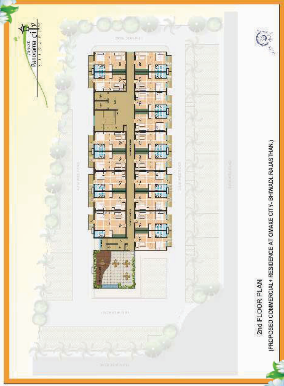
2nd FLOOR PLAN (PROPOSED COMMERCIAL+ RESIDENCE AT OMAXE CITY- BHIWADI, RAJASTHAN.)