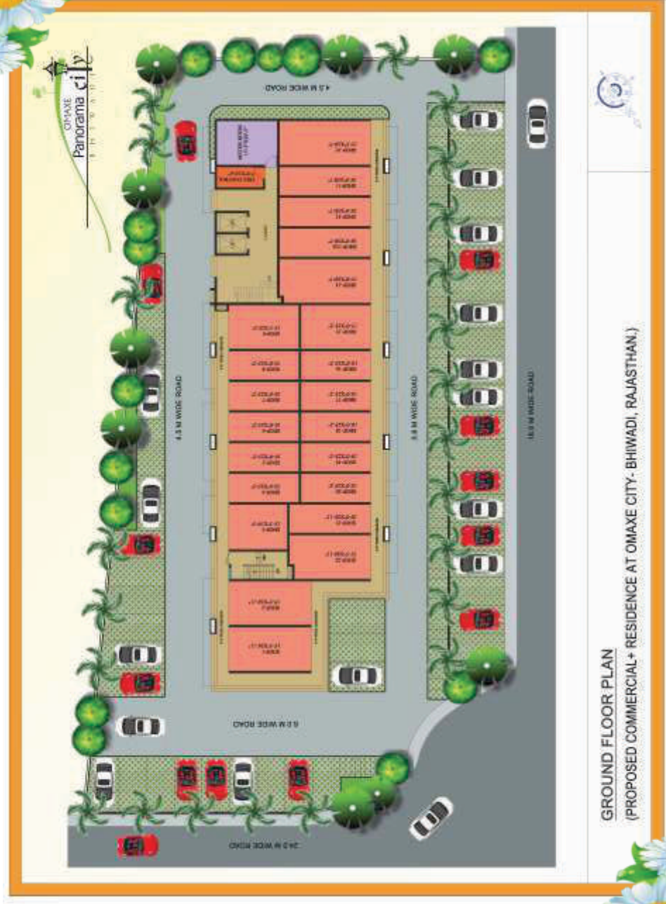
GROUND FLOOR PLAN (PROPOSED COMMERCIAL+ RESIDENCE AT OMAXE CITY- BHIWADI, RAJASTHAN.)