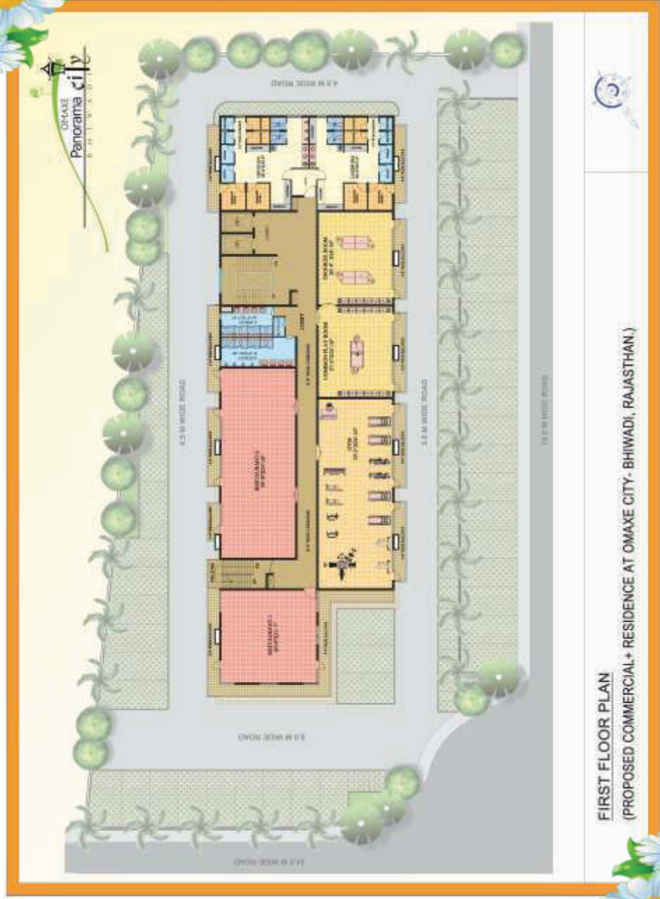
FIRST FLOOR PLAN (PROPOSED COMMERCIAL+ RESIDENCE AT OMAXE CITY- BHIWADI, RAJASTHAN.)