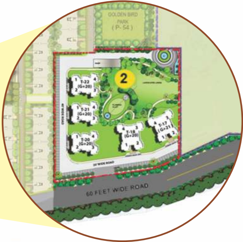
Resort Part-B: Phase 2 PBRERA-SAS80-PRO222