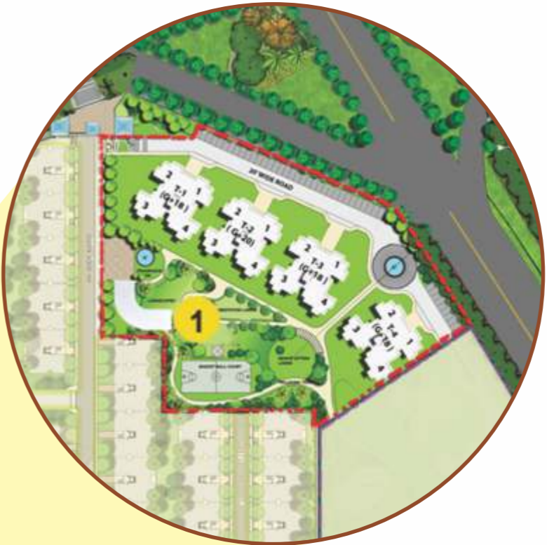
Resort Part-A: Phase 1 PBRERA-SAS80-PRO220

At The Resort, you will experience an unparalleled lifestyle with ample Greenery, open spaces and serene environment. Designed as the ultimate family home, The Resort's 2BHK, 3BHK and Penthouses are fully equipped with all modern amenities, leaving you awestruck. So, don't miss the chance to experience The Resort's most coveted lifestyle and become a part of the elite company along with Ambrosia, Celestia Royal, Celestia Grand and Silver Birch.