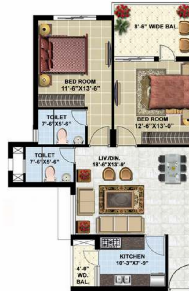
2 BHK TYPE-H Super Area-1280 sqft Builtup Area-1086 sqft Carpet Area-815 sqft