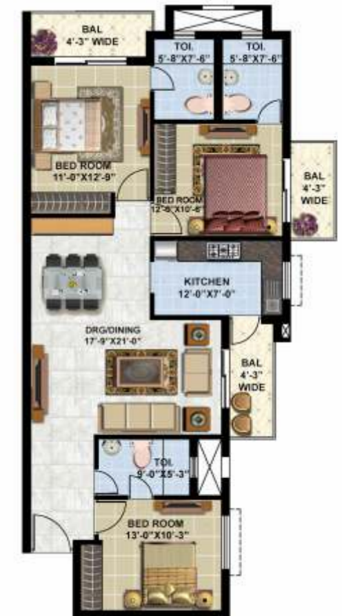
3 BHK TYPE-D Super Area-1550 sqft Builtup Area-1276 sqft Carpet Area-1032 sqft