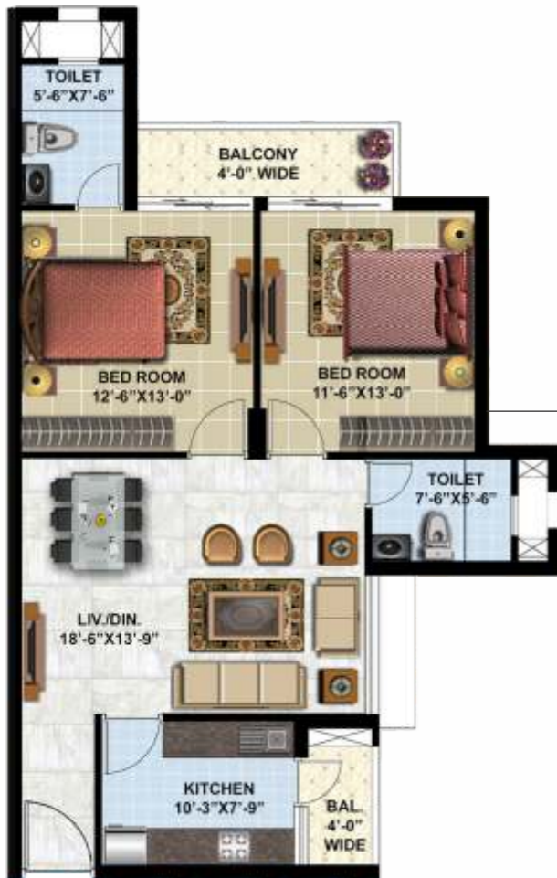
2 BHK TYPE-A Super Area-1190 sqft Builtup Area-975 sqft Carpet Area-780 sqft