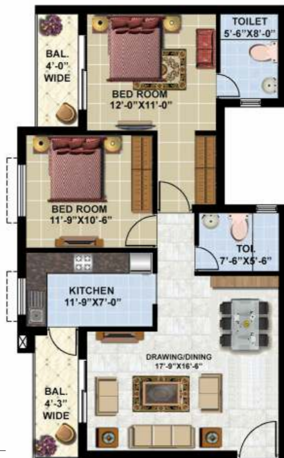
2 BHK TYPE-G Super Area-1190 sqft Builtup Area-975 sqft Carpet Area-780 sqft